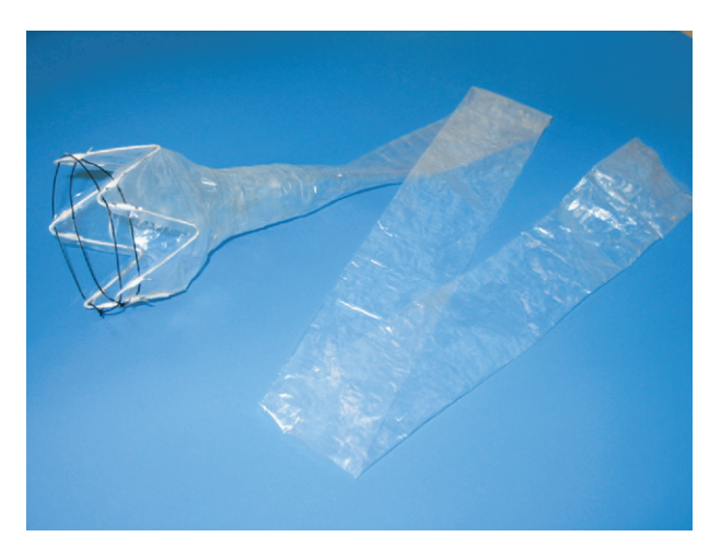
Fig. 1. DJBS implant.

nal bypass sleeve (DJBS) [3]. The DJBS contains an implant that is endoscopically delivered and anchored in the proximal duodenum and a sleeve that is extended into the jejunum (Fig. 1). Chyme passes through the sleeve, creating an intestinal bypass/biliopancreatic diversion without the need for stapling or anastomosis. The device has not yet received Food and Drug Administration approval. This report details our first human experience with the DJBS.